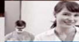
Medical & Allied Health Insurance