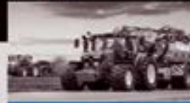
Agri/Food Business Insurance