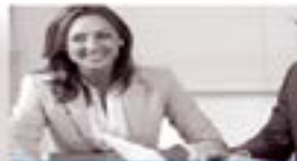
Professional Services & Accountant/Bookkeeper