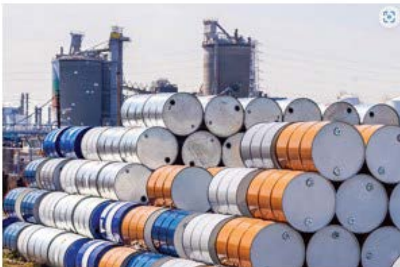
Brookside (ASX:BRK) carries with Continental for full Oklahoma oil