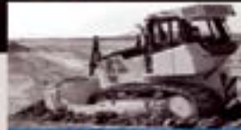
Civil Contractors Insurance