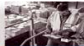
Workers Compensation Insurance